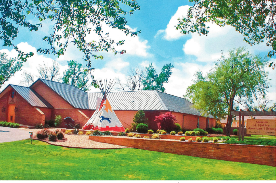
Museum of Native American History exterior