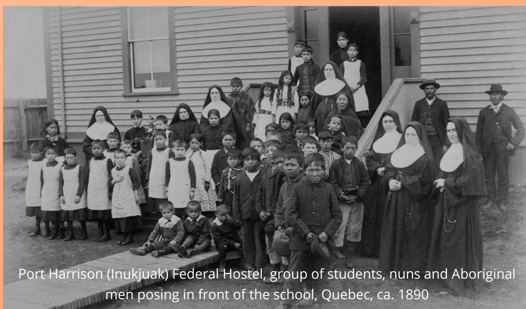
Port Harrison (Inukjuak) Federal Hostel, group of students, nuns and Aboriginal men posing in front of the school, Quebec, ca. 1890

This worldwide movement recognizes the history and contributions of Indigenous Peoples throughout the Americas. This year, we will honor those who never returned home from Indian Boarding Schools.